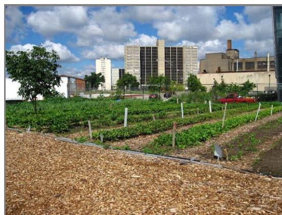
Fig. 4. A typical Detroit urban garden, 2012

Detroit's new land-use plan (2012) incorporates urban farming. The city has included farming under two landscape typologies, innovative productive and innovative ecological, with a minimum size of 0.8 hectares for such plots. The blue areas represent the two typologies, with the green areas representing green residential and park lands, together comprising over 50 per cent of the overall city footprint in this 50-year land-use scenario. This is more than adequate to support long term sustainable development (Fig. 5.).