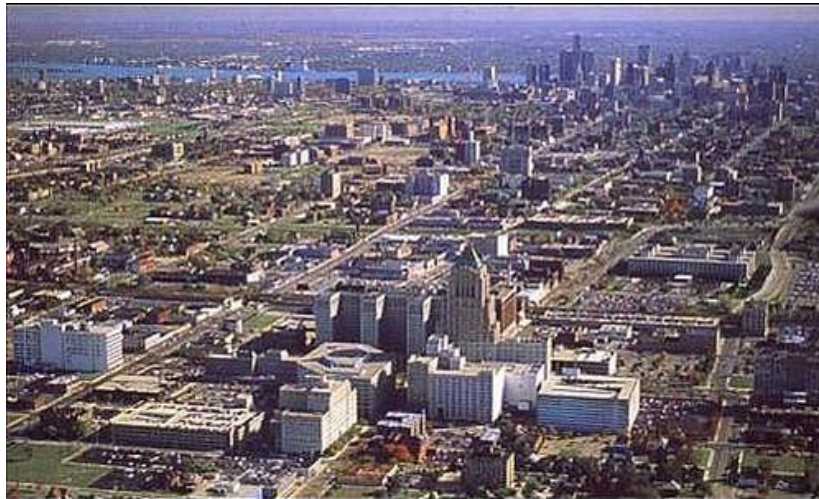
Fig. 1. Detroit, 2009

Looking at Detroit today it is hard to imagine that this was once the hub of the automotive industry in the world (Fig. 1.). The city peaked in 1950 with a population of 1.8 million, and has seen its fortunes wane each succeeding decade. The distinctive sound of Motown Records , a rhythm and blues recording company that arose in the 1960s, has now become a lament for a city that currently has a population of less than 800,000 persons.