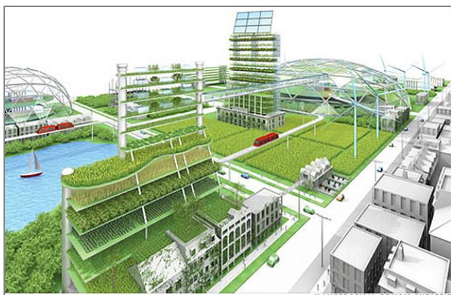
Fig. 3. An artist's conception of Detroit urban farming

of these areas into small scale farms for the urban poor (Rabinovitch, 1992). A situation not much unlike that of Detroit.