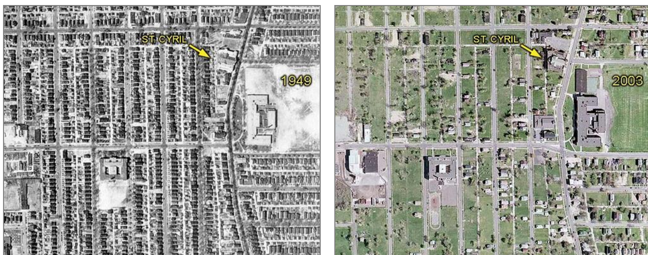
Fig. 2. Detroit neighborhood as seen in 1949 and 2003

To understand what went wrong, or rather what hasn't happened yet, we need to look at some of the factors that resulted in this unprecedented urban decay. This pair of photographs (Renn, 2009) shows how the city has devolved over the last 60 years (Fig. 2.).